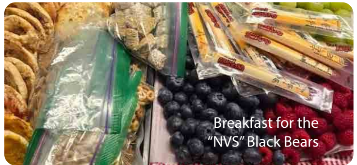
Breakfast for the "NVS" Black Bears

The NVS Black Bears are also, very hungry this time of year. Black bear families can help with the program by: